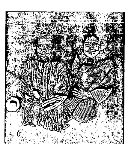
Two five year old girls from Kuwait dressed in traditional costume