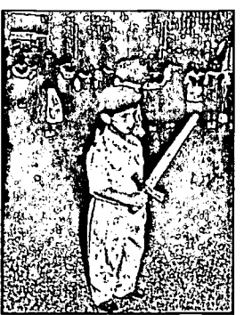
Five year old Kuwaiti boy dressed in military style.