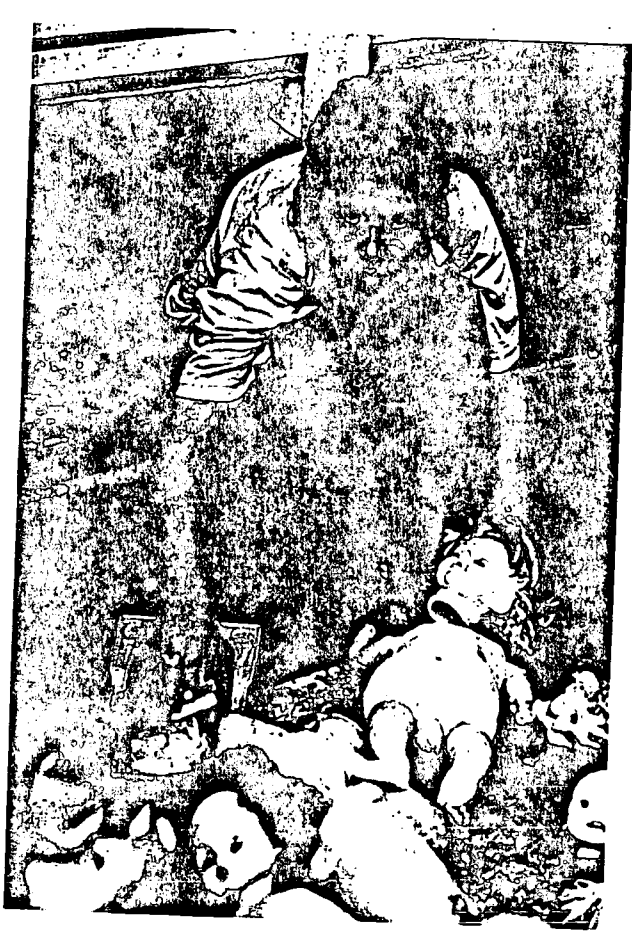
A member of the girls' group cleans up broken dolls for recycling.