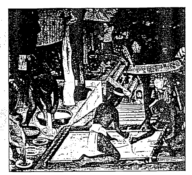
Mural by Diego Rivera from Ian James, Inside Mexico

Preschool-Gr. 2. This bilingual collection of 13 well-known Latino nursery rhymes includes favorites that have been passed down through generations. However, many of Cooney's illustrations depict stereotyped scenes of barefooted peasants in quaint, rural settings.