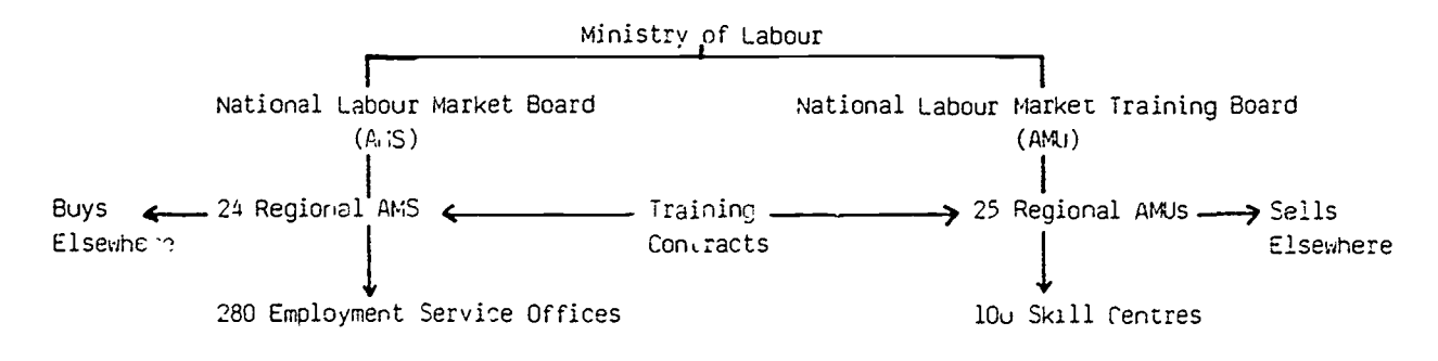
FIGURE 1: Labour Market Training Provision in Sweden

approximate relative size of the various training avenues are set out in Table 9.