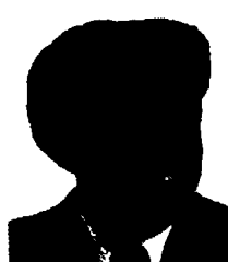
DONALD G. PHELPS Chancellor Seattle Community College District Washington