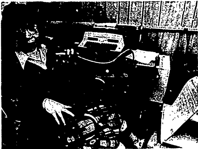
Special equipment enables the handicapped to learn typing.

After the handicapped students have been assessed and placed on the regular or special typewriter, they are treated as any other student. When they come into the classroom, they check in with a time clock, their