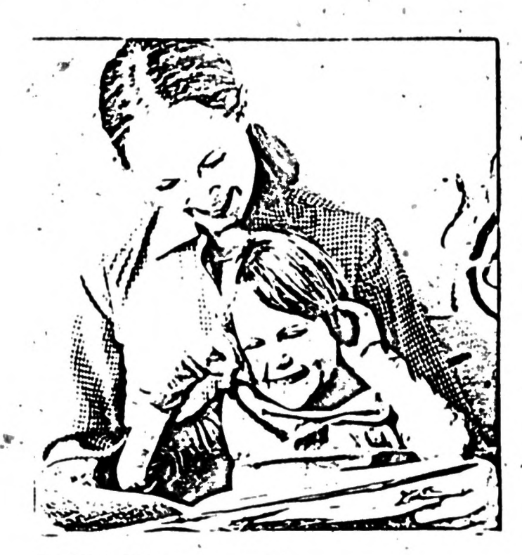
An IRA Micromonograph by Susan Mandel Glazer

Just as the child's system needs food for physical survival, so the mind needs language for survival in our literate society. Language activities happen everywhere—in the kitchen, in the bedroom, in the car. Activities often are natural outgrowths of family situations. Parents can develop some routine activities, beginning with their children as infants and continuing